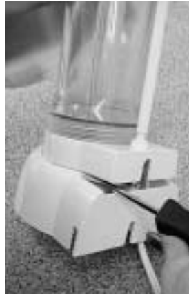
Figure 3 Counter-top stand removal